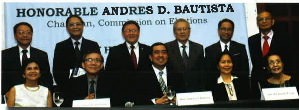
(PBA officers with Comelec Chairman Bautista)