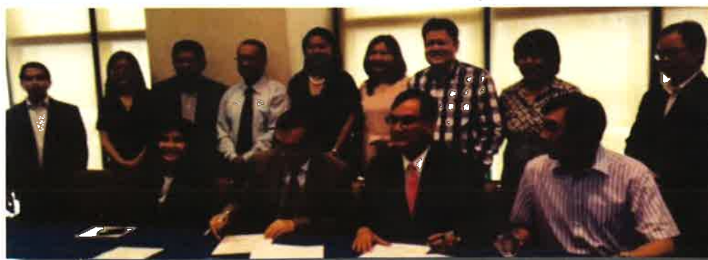
(PBA Officers and the Makati Judges)