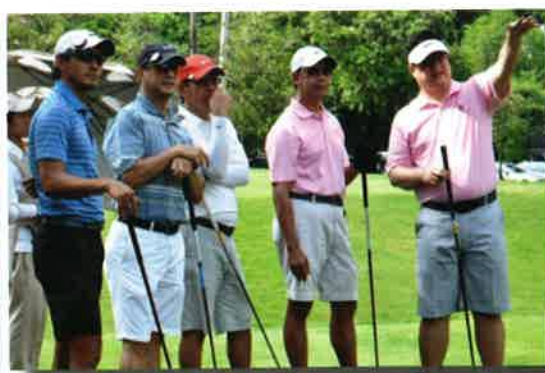
(PBA members and guests during the 2015 Golf Tournament)