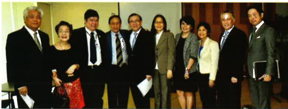
(PBA Past Presidents and current officers)