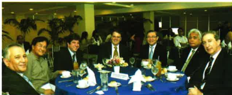
(With members of the diplomatic corps)