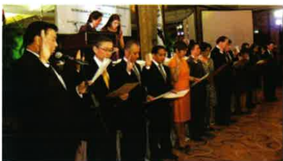
(Senate President Drilon with PBA Officers)